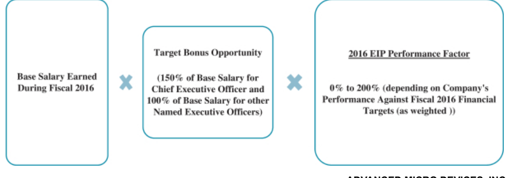
ADVANCED MICRO DEVICES, INC. | 2017 Proxy Statement 41

For fiscal 2016, each Named Executive Officer's annual cash performance bonus under the EIP was determined based on our performance during fiscal 2016. The following illustrates how the 2016 annual cash performance bonuses under the EIP were calculated: